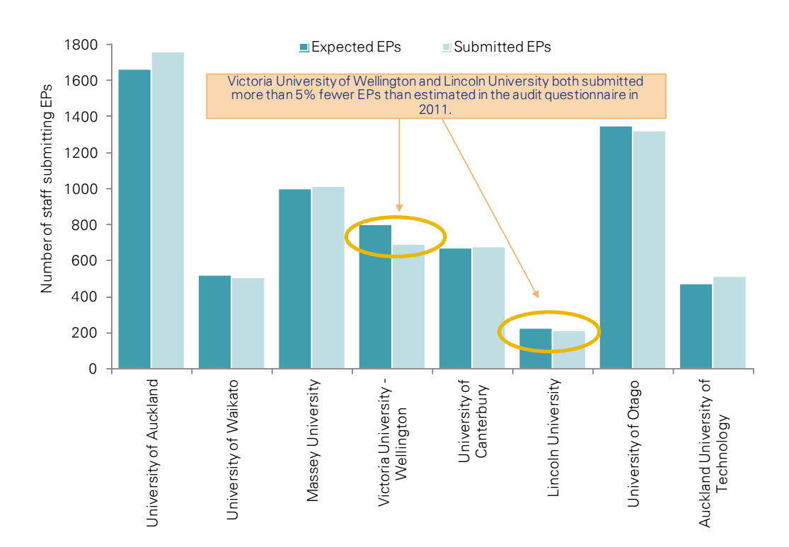
Graph 1 Comparison of expected EPs with actual EPs submitted

With the introduction of the revised PBRF Quality Evaluation reporting framework, we were advised of concerns in the sector that under the revised framework certain TEOs may elect to not submit their anticipated 'C' scoring researchers. It was considered that this may improve the AQS for certain TEOs. We did not identify any evidence to suggest this has occurred. If this practice had been followed through, it would have most likely benefited universities. To confirm this issue had not occurred, we compared the estimated number of EPs from each university as specified in the audit questionnaire in May 2011 with the actual number of EPs submitted in July 2012. (See Graph 1 below) This is a useful comparison because the information provided in the May 2011 audit questionnaire was collected before the changes to the reporting framework were consulted on.